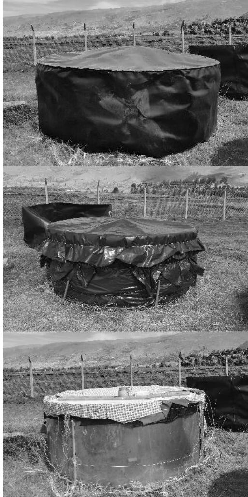
Figure 3: From bottom to top: 1) Cylindrical metal pool, Tyvek bag and sensor. 2) Low density black polyethylene coating. 3) high density black polyethylene