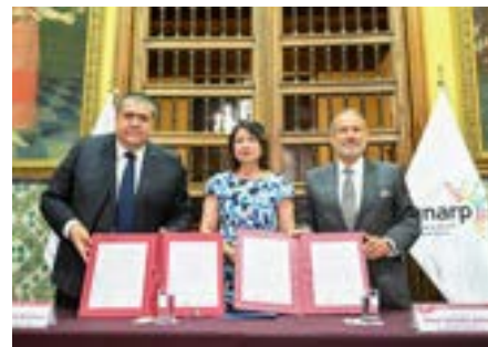
Signing of (2) agreements that will enable the interoperability and digitalisation of notarial documents