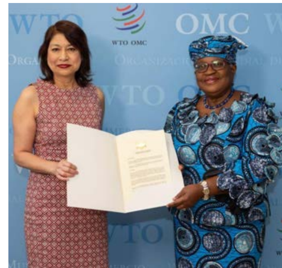
Minister of Foreign Affairs Ana Cecilia Gervasi and Director General of the World Trade Organisation Ngozi Okonjo-Iweala. Deposit of the instrument of acceptance of the Agreement on Fisheries Subsidies

Finally, it is worth highlighting Peru's recent ratification of the Agreement on Fisheries Subsidies within the World Trade Organisation (WTO), which is the first, at the multilateral level, to regulate the relationship between trade and the environment, in direct response to the United Nations Sustainable Development Goals.