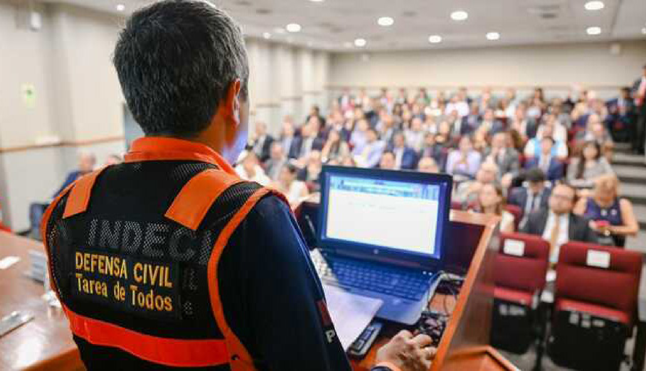
Meeting with the United Nations Resident Coordinator and 50 diplomatic missions accredited in Peru