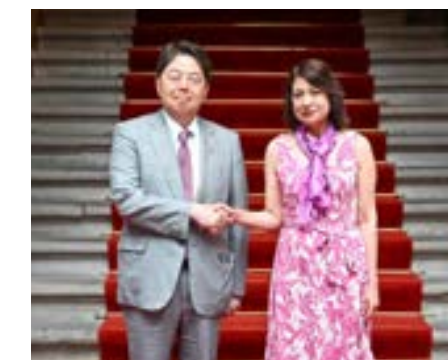
Meeting with Japanese Minister of Foreign Affairs, Yoshimasa Hayas