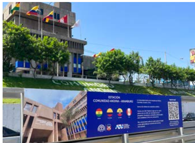
Andean Community Metropolitan Station - Aramburú

Within the framework of the Pro Tempore Presidency of the Andean Community, different initiatives and activities were promoted to bring the benefits of the integration process closer to Andean citizens. In this regard, the creation of the “Working Group for the Evaluation of the Reform, Modernisation, Strengthening and Re-engineering of the Andean Community”, and the reactivation of the High Level Group on Integration and Border Development, the Andean Committee of Environmental Authorities and the Andean Council of Ministers of the Environment and Sustainable Development are emphasised.