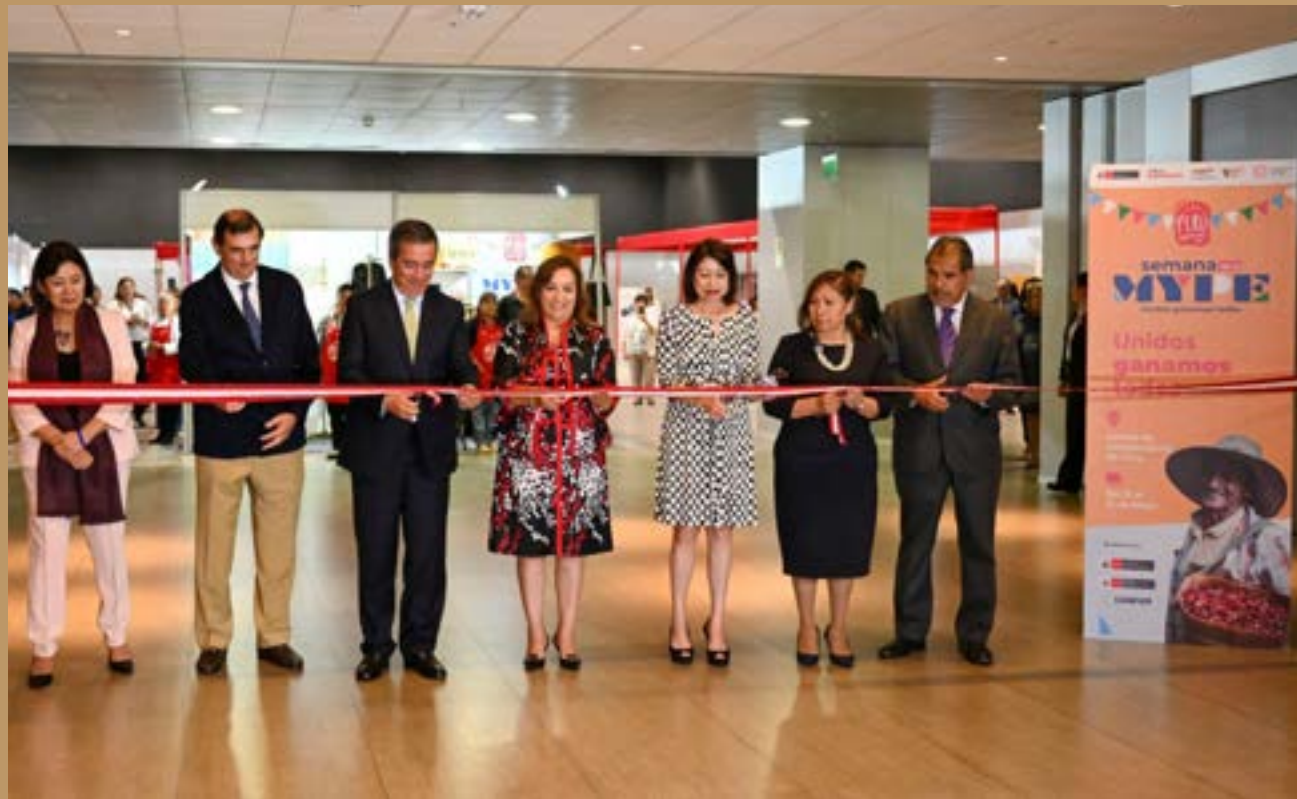
Opening of MSE Week

The good business climate in Peru has been confirmed, underpinned by its macroeconomic soundness and its legal framework committed to respecting private property and by its international commitments.