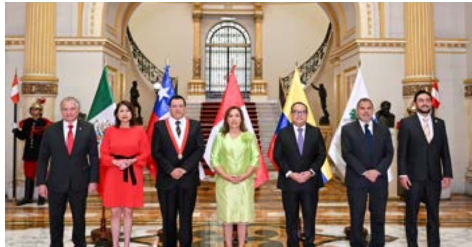
Presentation Ceremony of the Pro Tempore Presidency of the Pacific Alliance in the Government Palace of Peru

On 1 August, Peru assumed the Pro Tempore Presidency of the Pacific Alliance, which is made up of Mexico, Colombia and Chile, to which will be given the dynamism it requires to benefit the more than 230 million inhabitants of the bloc.