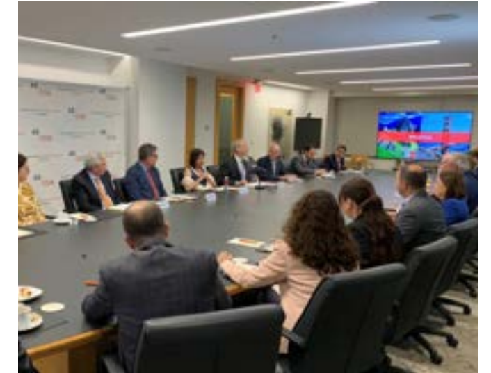
Meeting with business members of the Americas Society Council of the Americas (AS/COA)

Furthermore, the Ministry of Foreign Affairs has deployed efforts to promote spaces abroad in favour of the internationalisation process of our MSMEs, with emphasis on those led by women, in order to consolidate their insertion into global value chains.