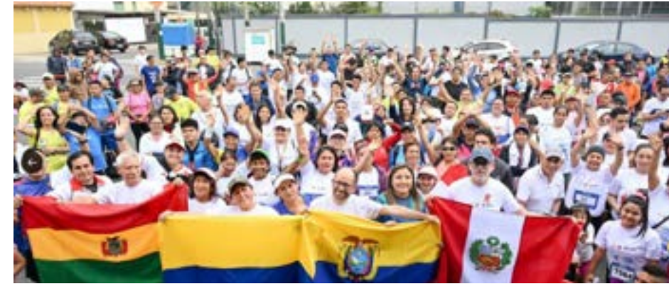
Andina Identity Race, which was attended by more than 3,000 Andean citizens