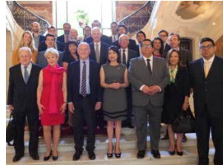
Presentation on the country's economic strengthening measures to the Movement of the Enterprises of France (MEDEF)