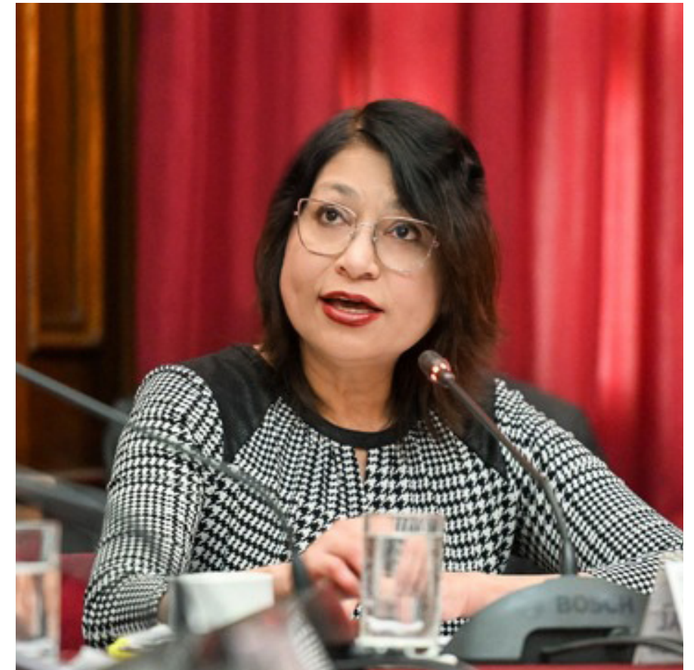
Speech by the Minister of Foreign Affairs of Peru, Ms. Ana Cecilia Gervasi at the 7th Extraordinary Session of the Foreign Affairs Commission of the Congress of the Republic