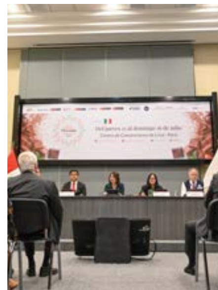
Launching Ceremony of the XIV Peru Cacao and Chocolate Fair 2023