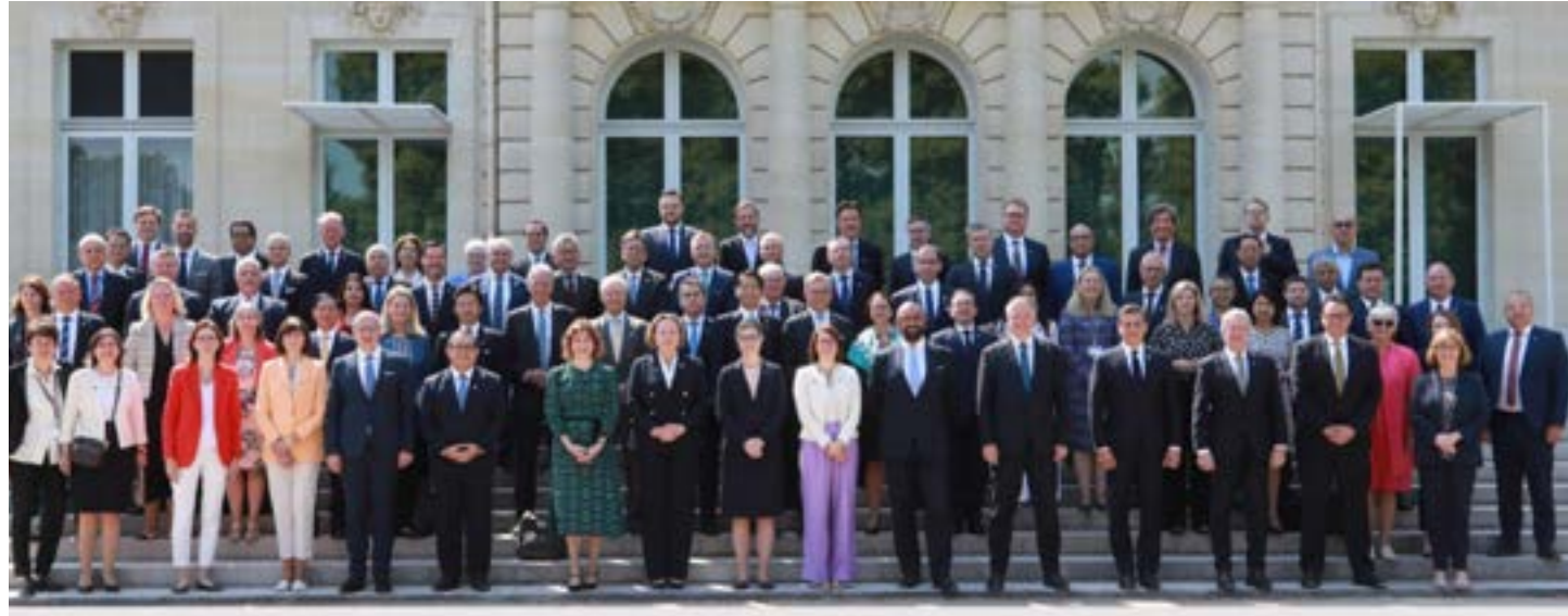
Ministerial Meeting of the OECD Council

The full validity of the rule of law, respect for democratic institutions, and the defence and promotion of human rights in Peru were reaffirmed.