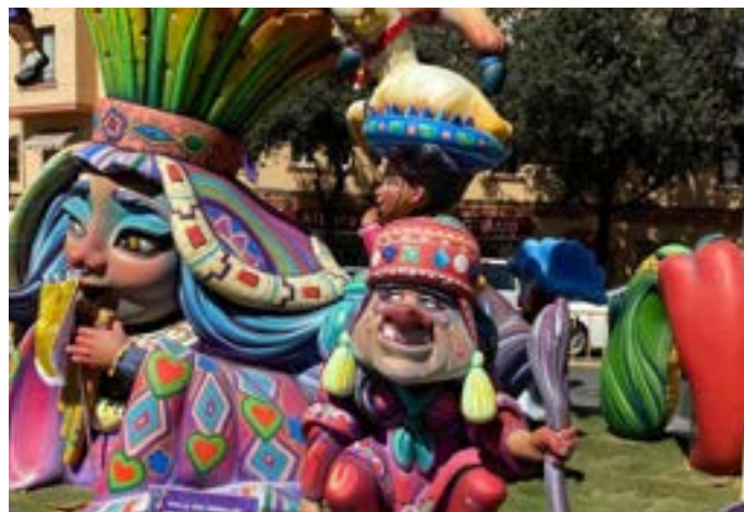
Exhibition of sculptures representative of our culture, in Valencia, Spain