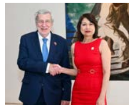
Meeting with the Minister of Foreign Affairs of Chile, Alberto Van Klaveren