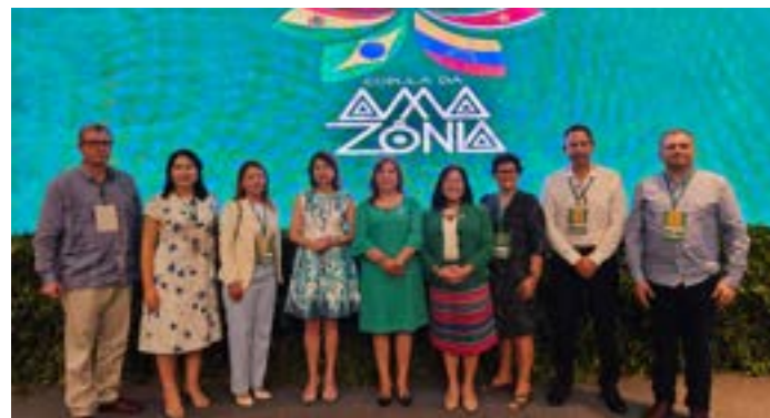
IV Meeting of Presidents of the States Parties to the Amazon Cooperation Treaty