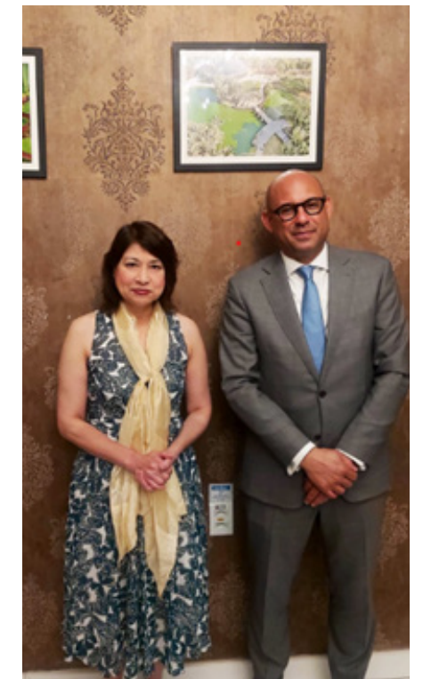
UN Climate Executive Secretary Simon Stiell

The Amazon with a Human Face was the vision that took shape at the Amazon Summit held in Belém do Pará, Brazil. This was based on the full return of presidential diplomacy with the outstanding participation of President Dina Boluarte on her first trip abroad, reaffirming Peru’s international position at the most important meeting of Amazonian leaders and reinvigorating our relationship with Brazil.