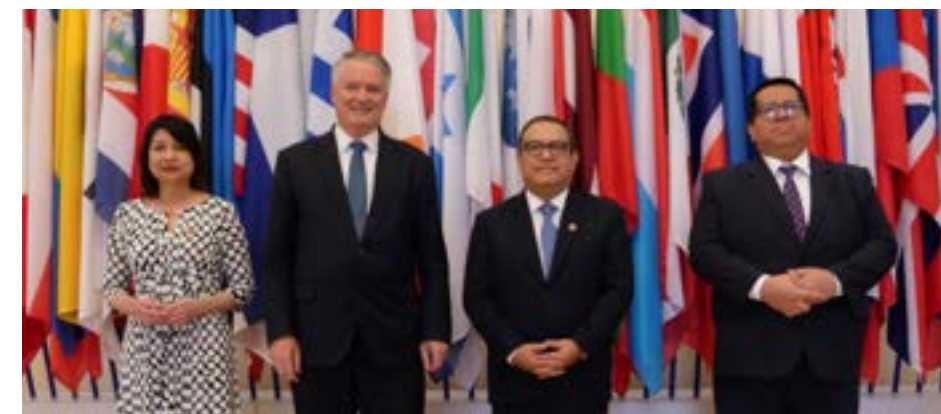
Meeting with the Secretary-General of the OECD

objective. Thus, all efforts will continue to be made to ensure that Peru complies with the process of accession to this organisation, which seeks to promote greater institutional strengthening of the country and to provide better public services for all Peruvians.