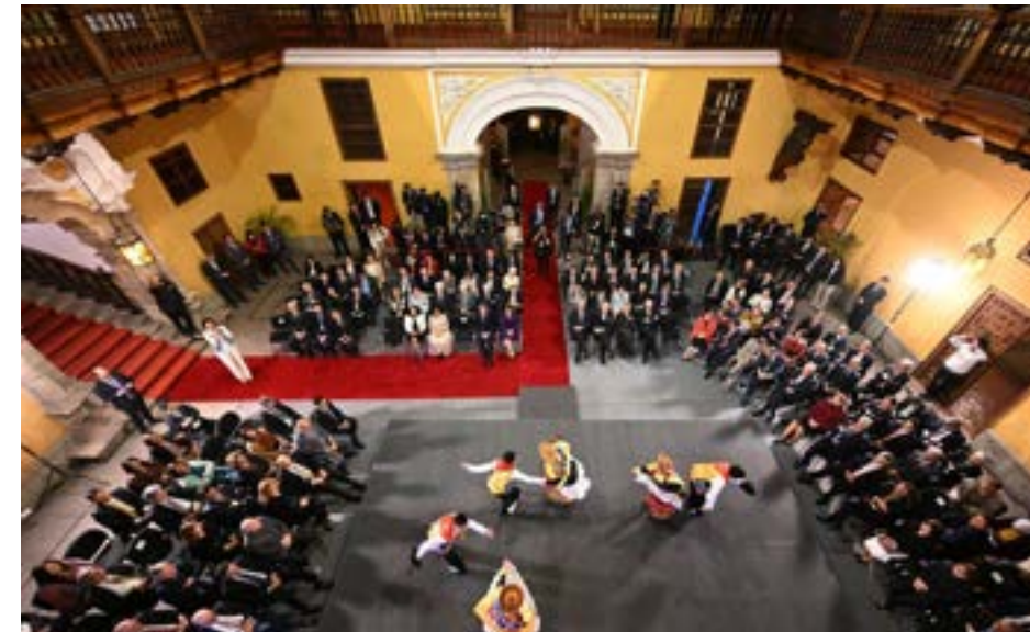
Central ceremony to commemorate 150 years of bilateral diplomatic relations between Peru and Japan

Also noteworthy is the recent trip of the Minister of Foreign Affairs, Ana Cecilia Gervasi to Paraguay for the ceremony of the inauguration of President Santiago Peña, and the signing of the Specific Agreement between the Governments of Ecuador and Peru for the implementation of the Binational Border Care Centre Macará - La Tina, which will facilitate and improve the movement of people, goods and vehicles, as well as trade and the flow of tourists.