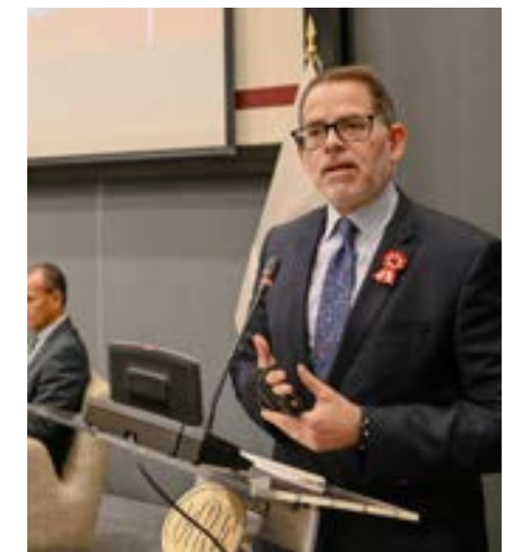
Preparatory Communications Workshop for the Peruvian Chairmanship of APEC 2024

Next November, we will assume for the third time the Presidency of the Asia-Pacific Economic Cooperation - APEC, a sign of Peru's position in the Asia-Pacific region. The exercise of our presidency in this cooperation mechanism will promote economic growth and the welfare of the population of its 21 member economies, as well as will defend free trade and investment, promoting regional integration.