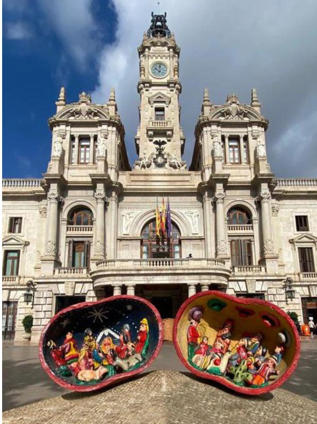
Digital photography competition called “El Perú en: “ (Peru at ...); this capture was taken in the Kingdom of Spain

This year, the Foreign Ministry's cultural promotion work significantly expanded its ambition and scope. Under the slogan “El Perú de todas las sangres para el mundo” (“Peru of all bloods for the world”), more than 875 events have been organised in more than 90 Peruvian missions abroad. These events took place in areas dedicated to the visual arts, music and performing arts, book presentations and conferences.