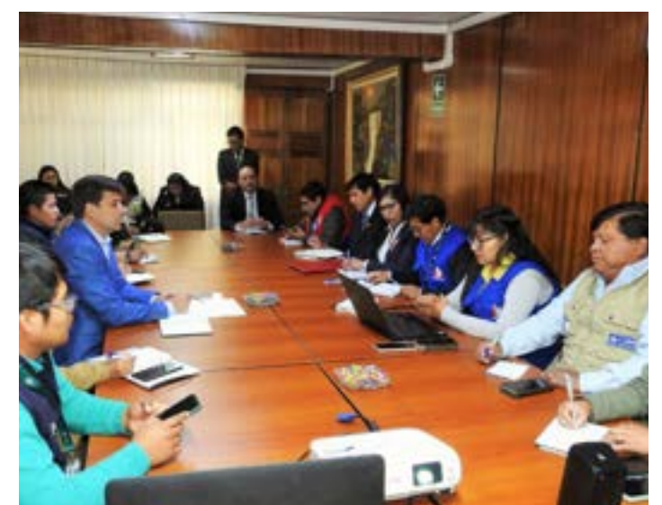
Intersectoral Working Table for Migration Management in Puno, chaired by the Ministry of Foreign Affairs