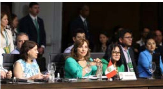
Participation of President Dina Boluarte, accompanied by the Minister of Foreign Affairs, Ana Cecilia Gervasi and the Minister of the Environment, Albina Ruiz Ríos