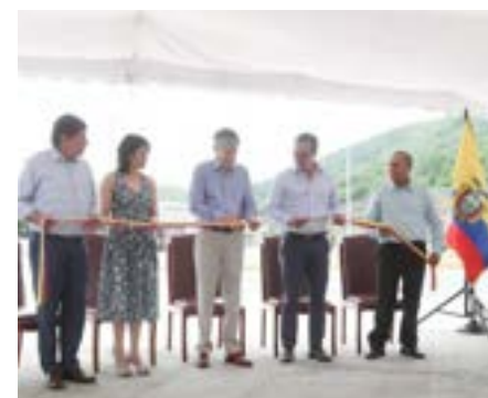
Opening of the Bi-national Border Care Centre (CEBAF) Macará-La Tina