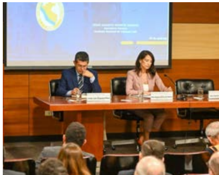
Meeting with the United Nations Resident Coordinator and 50 diplomatic missions accredited in Peru

This is based on the creation of programmes and activities promoted in a multisectoral manner in areas such as education, culture, among others.