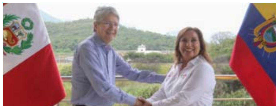
Bilateral meeting between the President of Peru and her counterpart from Ecuador, Guillermo Lasso, as part of the activities of the CEBAF La Tina- Macará inauguration ceremony