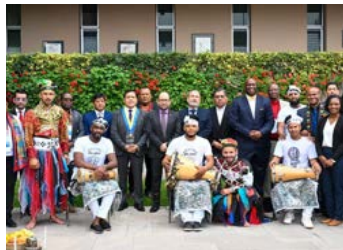
III Afro-Andean Forum of the Andean Community