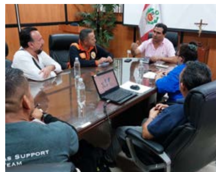
Meeting with the Regional Governor of Piura and INDECI to discuss the progress of the Humanitarian Network in favour of those affected by the rains