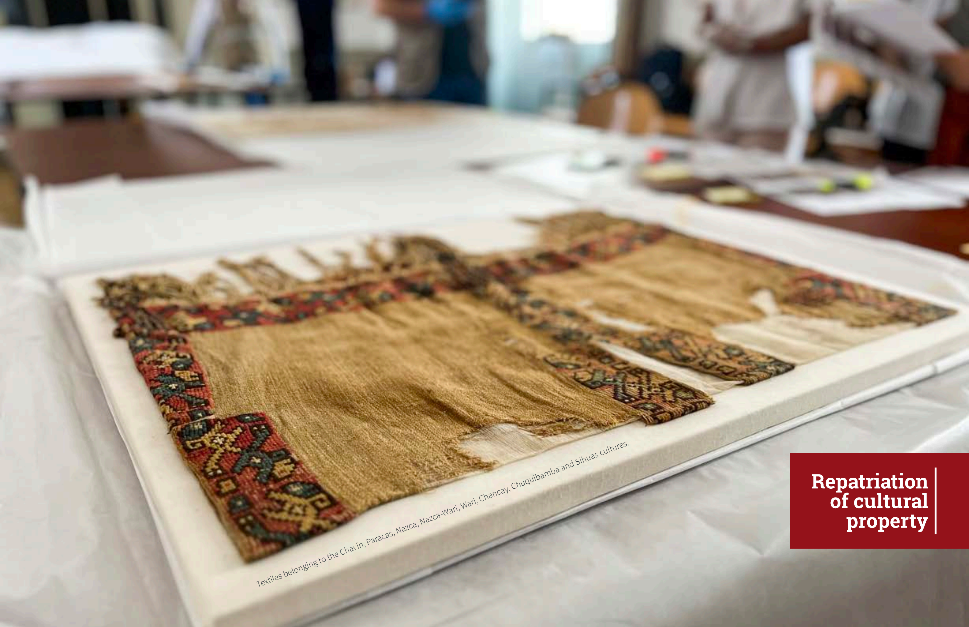
Textiles belonging to the Chavín, Paracas, Nazca, Nazca-Wari, Wari, Chancay, Chuquibamba and Sihuas cultures.