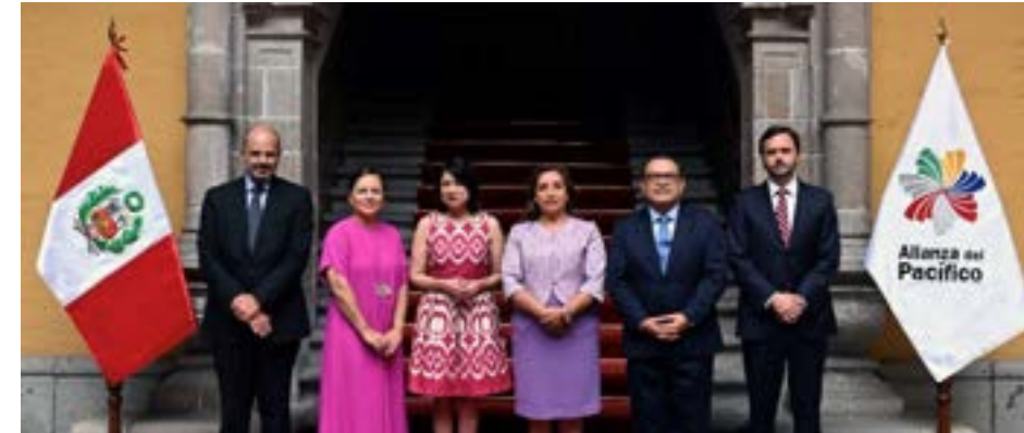
Working meeting with the President of the Republic, Dina Boluarte and members of the Pacific Alliance Business Council