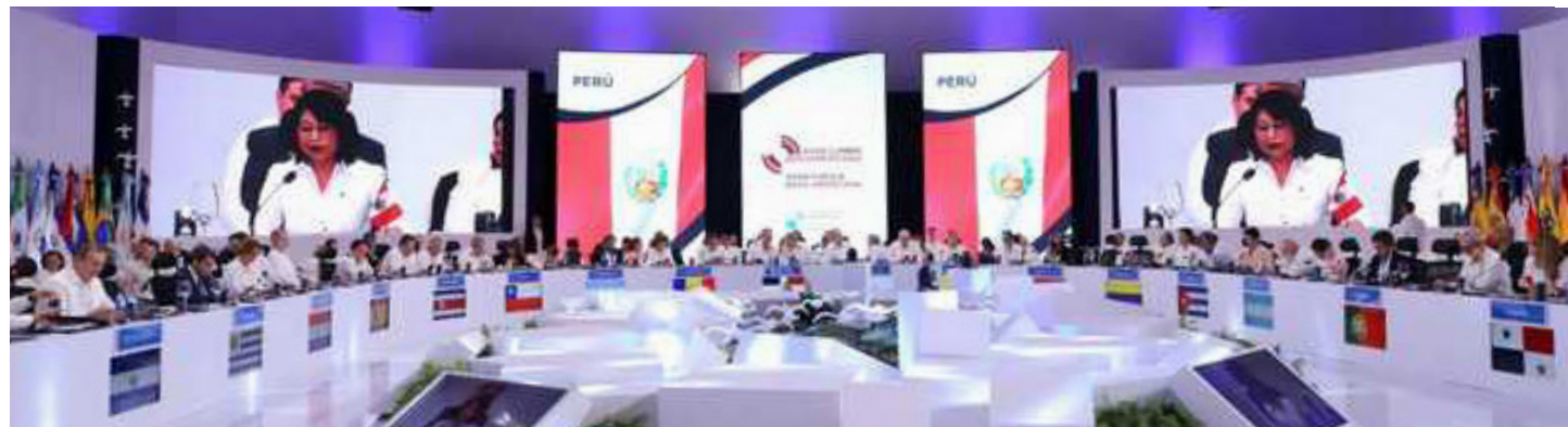
XXVIII Ibero-American Summit of Heads of State and Government

the second Summit for Democracy, the 53rd General Assembly of the OAS in Washington and the recent CELAC- European Union Summit, to mention just a few high-level meetings.