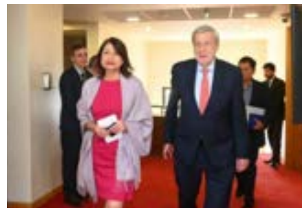
Transfer of the Pro Tempore Presidency of the Pacific Alliance: Minister of Foreign Affairs, Ana Cecilia Gervasi and his Chilean counterpart Alberto Van Klaveren

This event represents the renewed commitment of the members of the bloc to regional integration in order to face shared challenges. Under the Pro Tempore Presidency of Peru, the Pacific Alliance will be consolidated as a platform for regional integration.