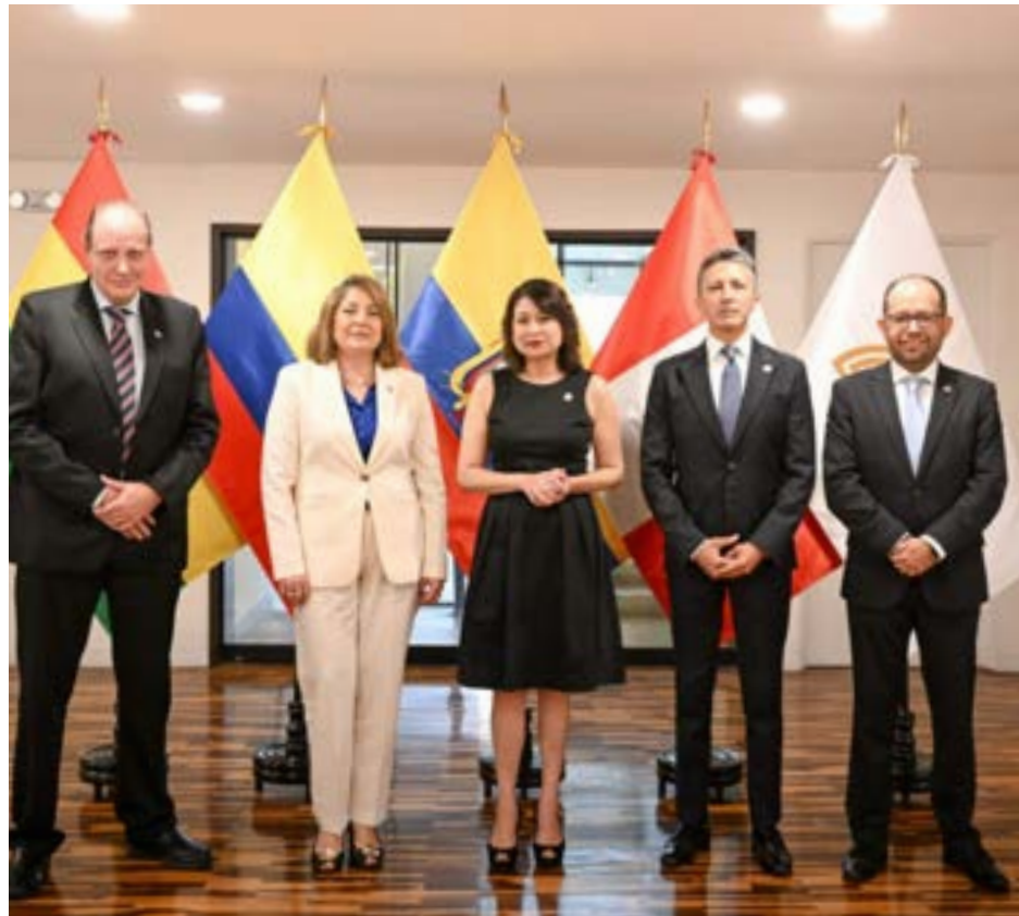
XXVIII Meeting of the Andean Council of Ministers of Foreign Affairs of the Andean Community

Within the framework of the Pro Tempore Presidency of the Andean Community, different initiatives and activities were promoted to bring the benefits of the integration process closer to Andean citizens. In this regard, the creation of the “Working Group for the Evaluation of the Reform, Modernisation, Strengthening and Re-engineering of the Andean Community”, and the reactivation of the High Level Group on Integration and Border Development, the Andean Committee of Environmental Authorities and the Andean Council of Ministers of the Environment and Sustainable Development are emphasised.