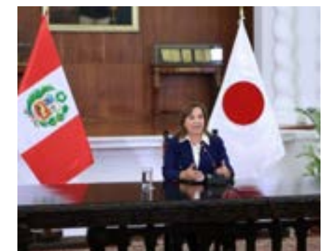
Bilateral virtual meeting with the Prime Minister of Japan, Fumio Kishida