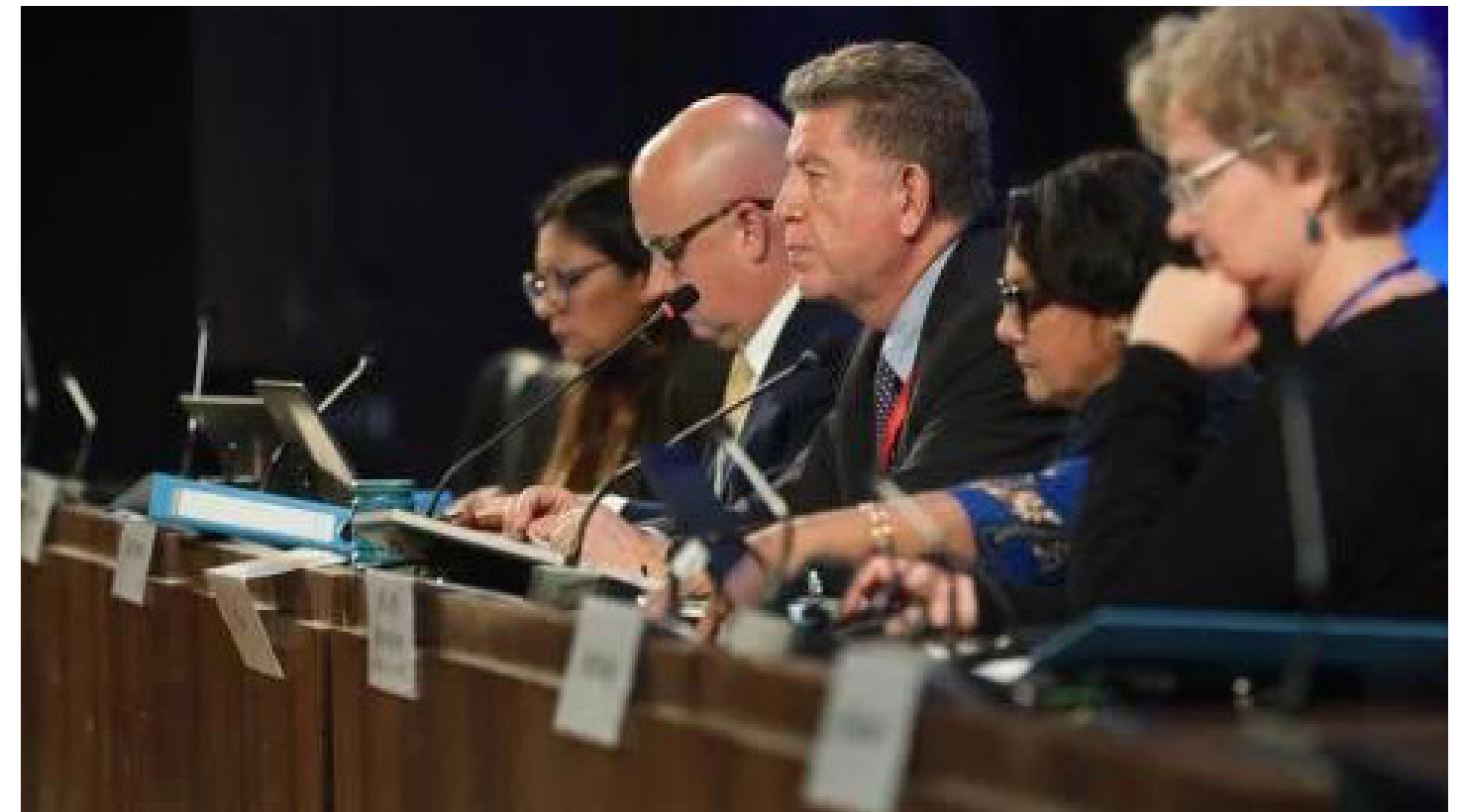
II Meeting of the Intergovernmental Negotiating Committee for the Development of an International Instrument to End Plastic Pollution

In addition, our country is promoting an ambitious binding agreement based on a comprehensive approach to prevent and reduce plastic pollution in the environment. Along these lines, initiatives continue to be furthered so that Peru can consolidate its leadership in this process that will lead to the development of an international instrument that will put an end to this environmental problem.