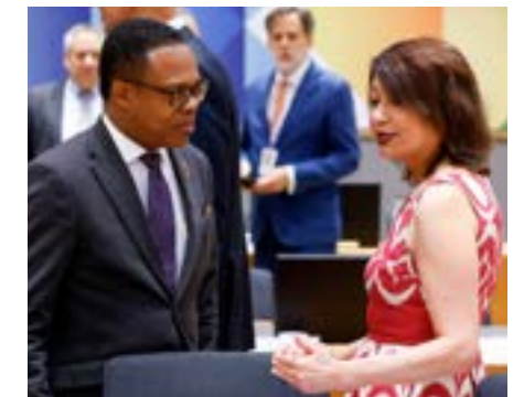
High-level meeting with the Minister of Foreign Affairs of Trinidad and Tobago, Amery Browne

Furthermore, the official visit of the Japanese Foreign Minister, Yoshimasa Hayashi, in the framework of the commemoration of the 150th anniversary of the establishment of bilateral diplomatic relations between Peru and Japan, is highlighted. At the same time, substantive high-level bilateral meetings with Argentina, Belize, Brazil, Canada, Chile, Costa Rica, Ecuador, Spain, the United States of America, Greece, Paraguay, Portugal, Ukraine, Suriname, among others, are highlighted.