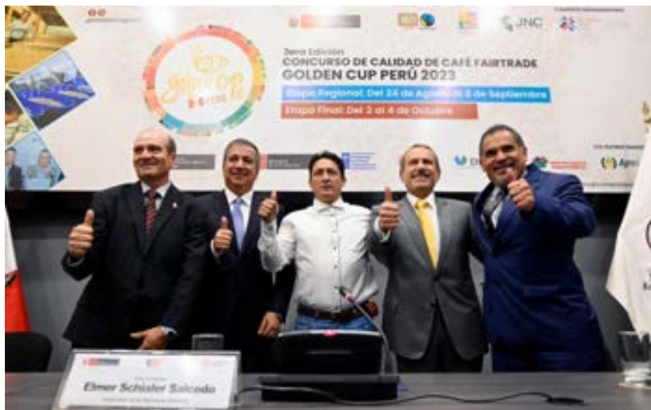
Launching of the III Edition of the Fairtrade Golden Cup Peru 2023 Coffee Quality Contest