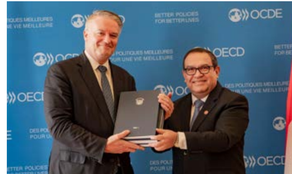
Submission of the Memorandum initiating our accession process to the OECD