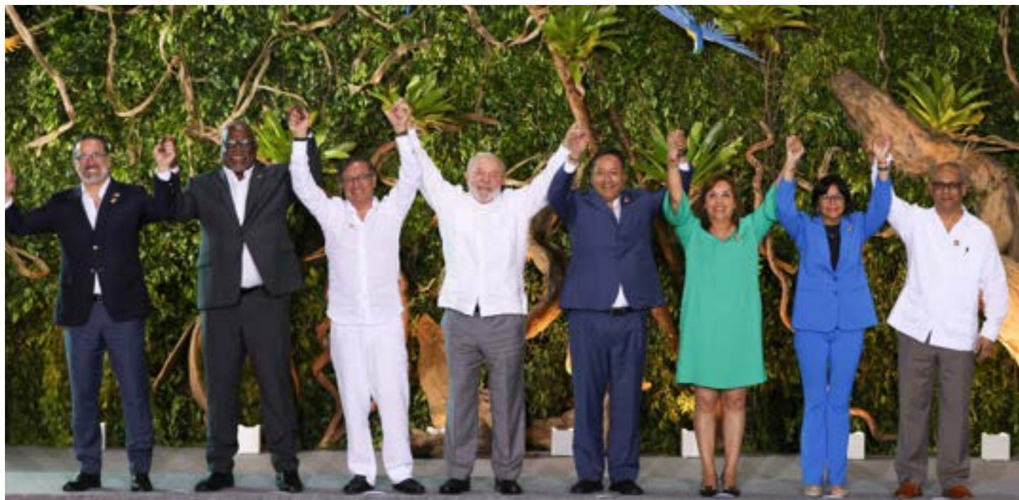
IV Meeting of Presidents of the States Parties to the Amazon Cooperation Treaty