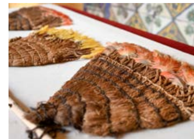
Textiles belonging to the Chavín, Paracas, Nazca, Nazca-Wari, Wari, Chancay, Chuquibamba and Sihuas cultures

Through our diplomatic missions abroad, and in close cooperation with the Ministry of Culture, we have managed to recover archaeological, documentary and historical-artistic assets that were illegally removed from our country.