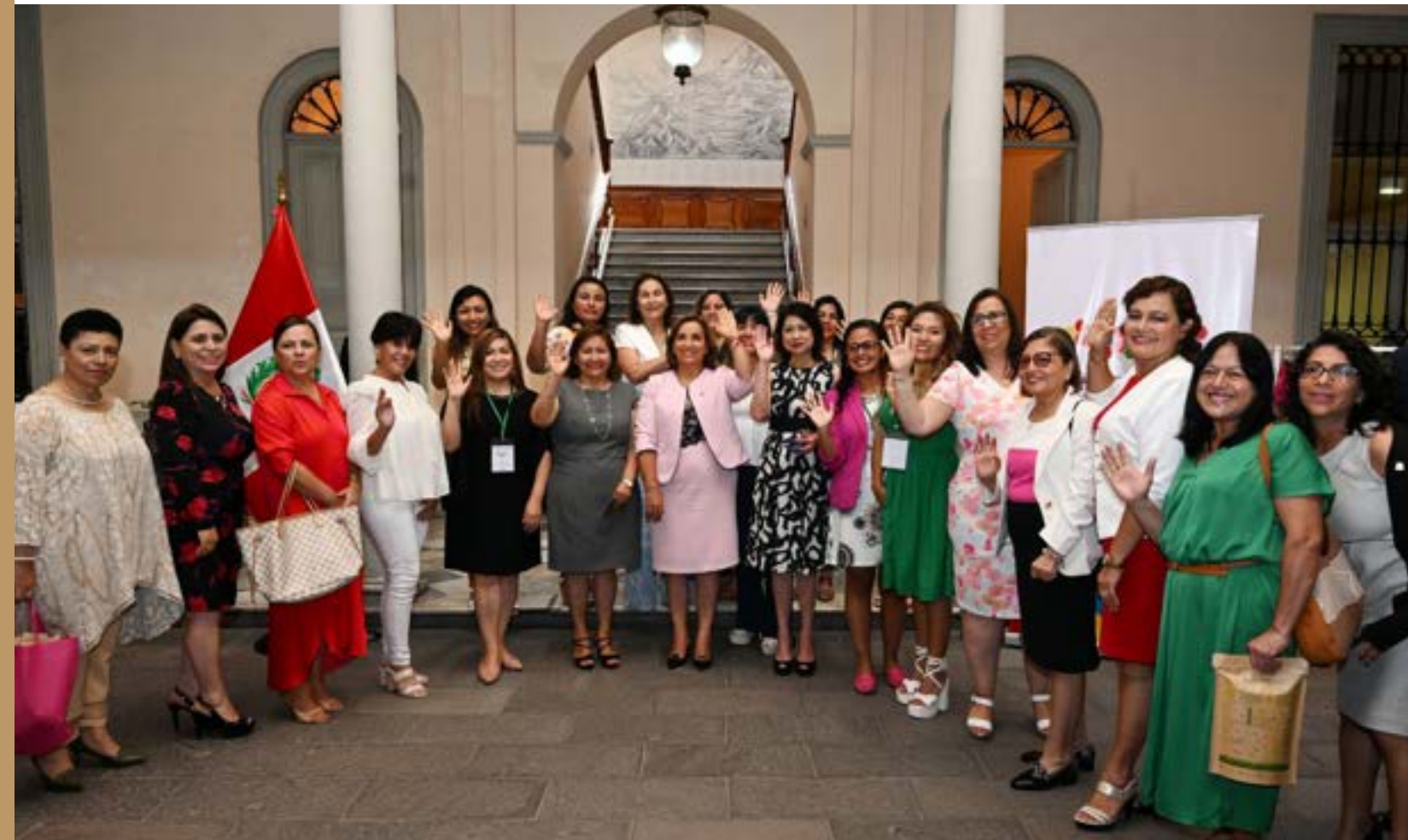
On Women's Day, an exhibition of 11 enterprises run by women from the Asociación PYME Perú was organised

Furthermore, the Ministry of Foreign Affairs has deployed efforts to promote spaces abroad in favour of the internationalisation process of our MSMEs, with emphasis on those led by women, in order to consolidate their insertion into global value chains.