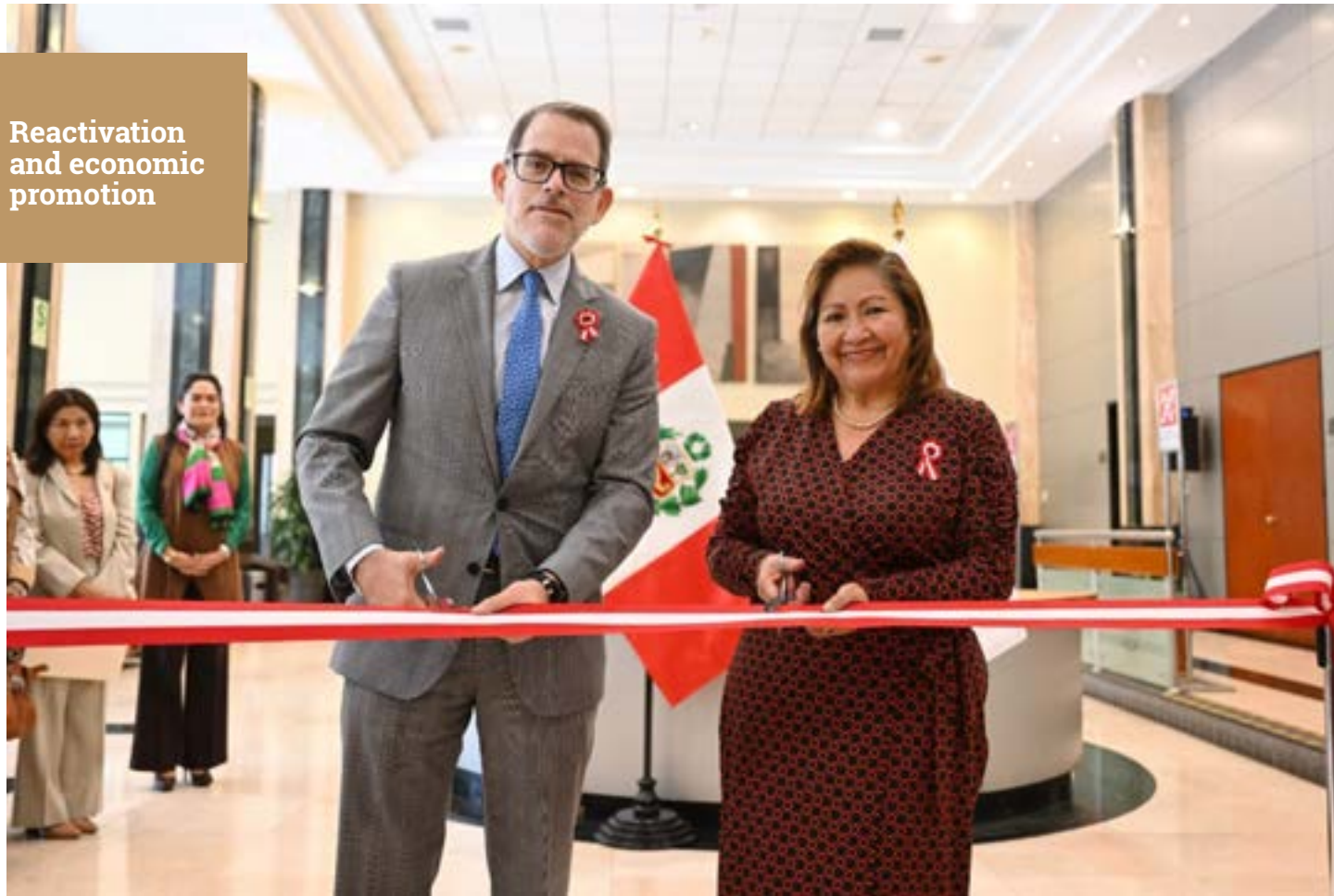
Exhibition "Mujeres emprendedoras" (Women entrepreneurs): 11 women- driven ventures of the Asociación PYME Peru