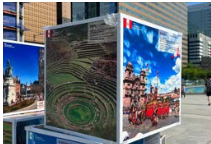
The Embassy of Peru in South Korea participated in the “Seoul Friendship Festival”