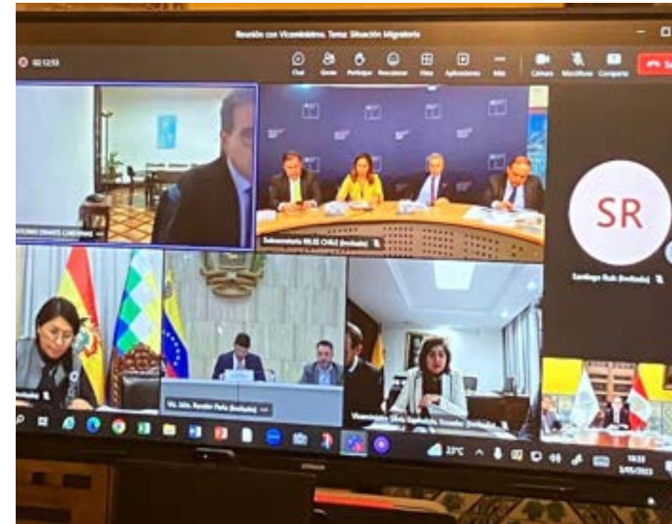
Political dialogue at the level of Vice Ministers of Bolivia, Chile, Colombia, Ecuador, Peru and Venezuela