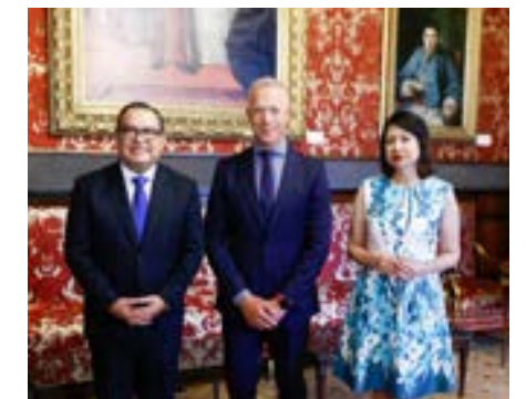
resident of the Spanish Senate, Ander Gil