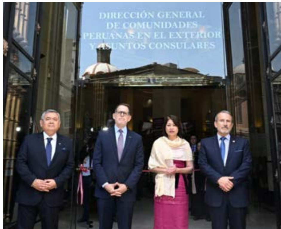
New Consular Office opened for consular procedures

Along with the new premises for consular procedures have recently been inaugurated, which will improve the services requested by citizens.