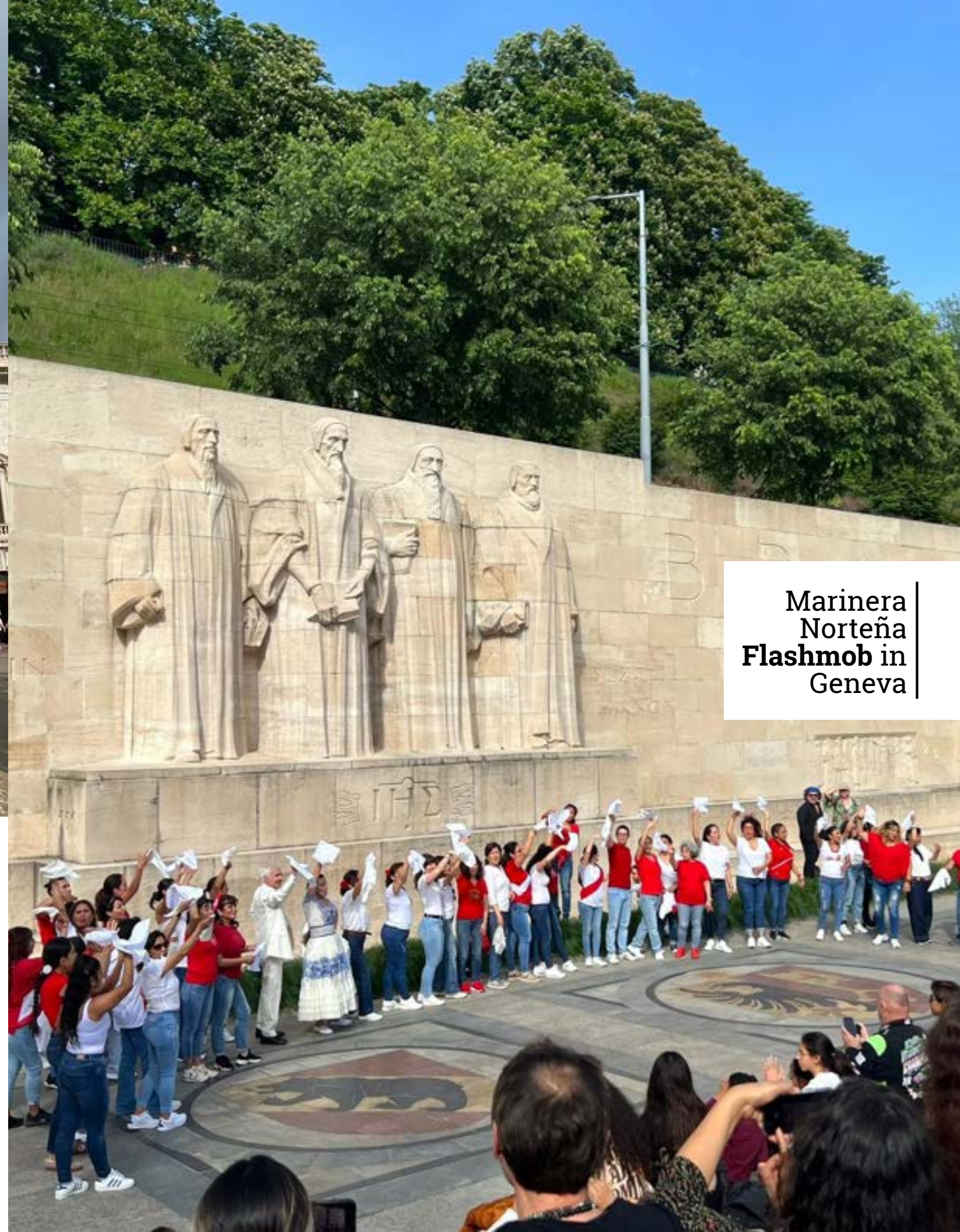
Marinera Norteña Flashmob in Geneva