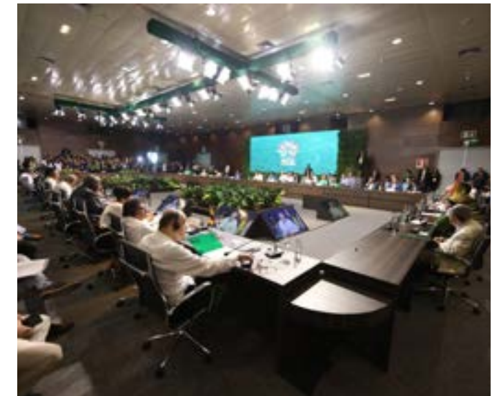
IV Meeting of Presidents of the States Parties to the Amazon Cooperation Treaty

As a result of this effort, the Belem Declaration and the Joint Communiqué “Unidos por Nuestros Bosques” (“United for Our Forests”) were approved, documents that will allow further progress and positive actions towards the sustainable development of the Amazon and its peoples.