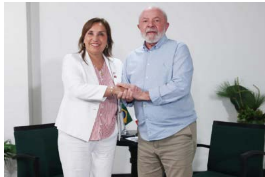
In the framework of the Amazon Summit, bilateral meeting between the President of Peru, Dina Boluarte and her Brazilian counterpart, Luiz Inácio Lula da Silva

Also worth mentioning is the important rapprochement with the countries of the Caribbean Community (CARICOM), as well as with Africa, the Middle East and the Gulf countries. In this regard, new partnerships have been established with Angola, Namibia, Azerbaijan and Iran, and the partnerships with St. Kitts and Nevis, St. Vincent and the Grenadines, Oman, Syria and Jordan have been reactivated.