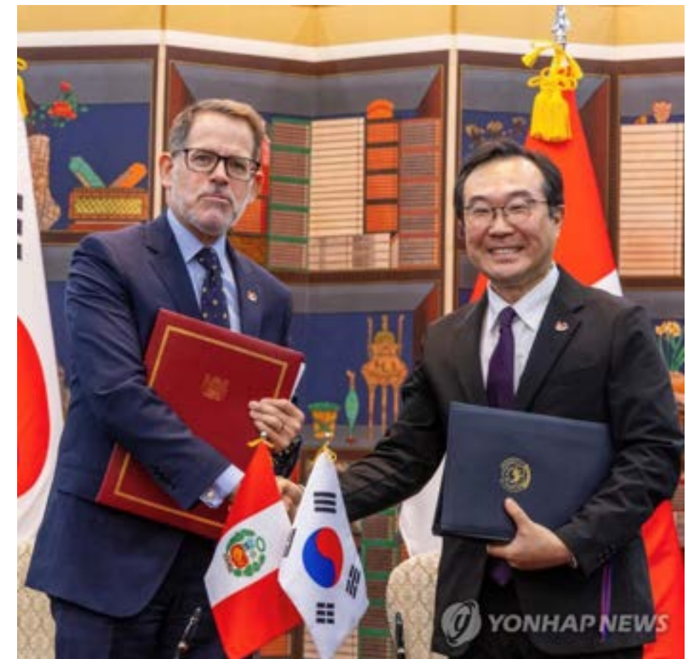
Air Services Agreement with Korea

In addition, two Air Services Agreements have been signed with the Republic of Korea and the United Arab Emirates, in April and May, respectively. These agreements will help to increase our exports to these countries, to attract more investment and to attract new flows of tourists.